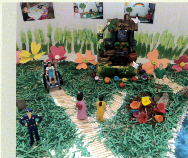
“My Beautiful Garden” 2014 STEAM Fair Exhibit

“This year we plan to deepen our relationships with the families we serve and partner with them in the work of preparing their children for life.”