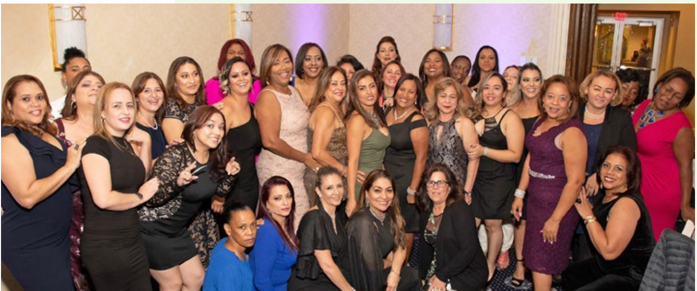
Below: Educators gathered for 30th Anniversary celebration on October 13, 2018